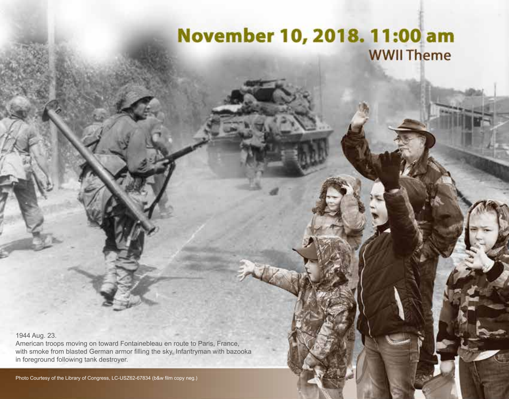
1944 Aug. 23. American troops moving on toward Fontainebleau en route to Paris, France, with smoke from blasted German armor filling the sky. Infantryman with bazooka in foreground following tank destroyer.

Photo Courtesy of the Library of Congress, LC-USZ62-67834 (b&w film copy neg.)