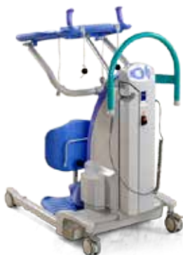
ArjoHuntleigh Sara 3000