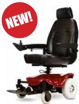
Shoprider Streamer Sport