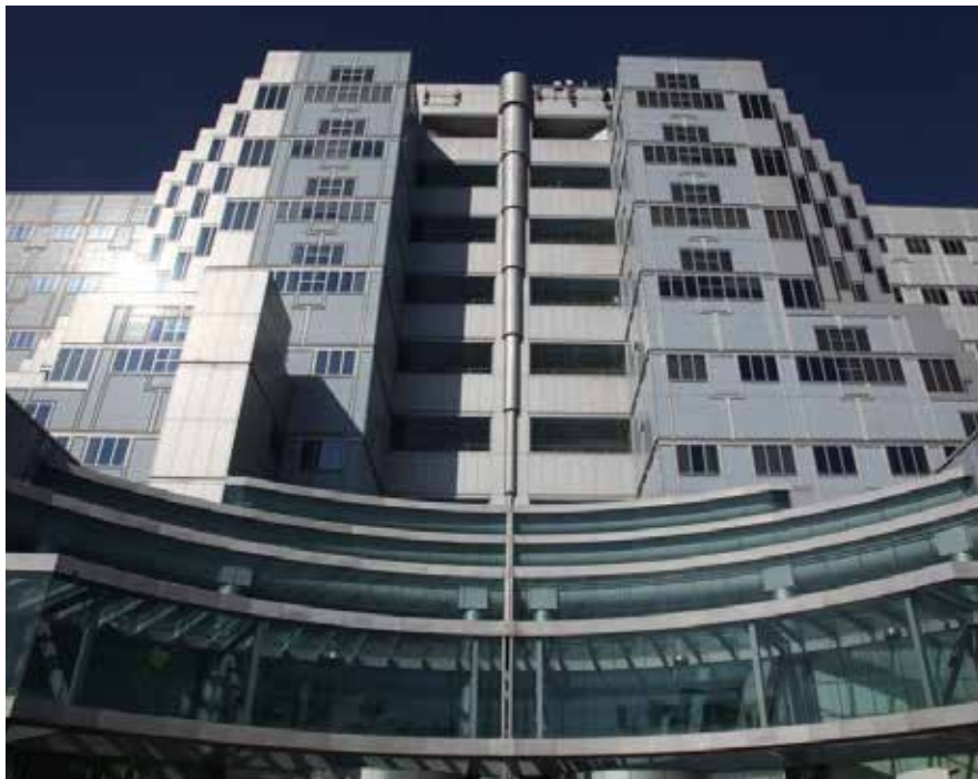
Veterans Affairs Medical Center

Remember the chapter is here to serve you. We would love to hear from you about your experiences with the SCI/D care you receive from Seattle – Vancouver – Outpatient Clinic. Please let us know if you have had delays in receiving your healthcare and/or prosthetic equipment as well as if you've had exceptional service from a program and/or employee. Call the PVA Oregon Chapter office at 503-362-7998.