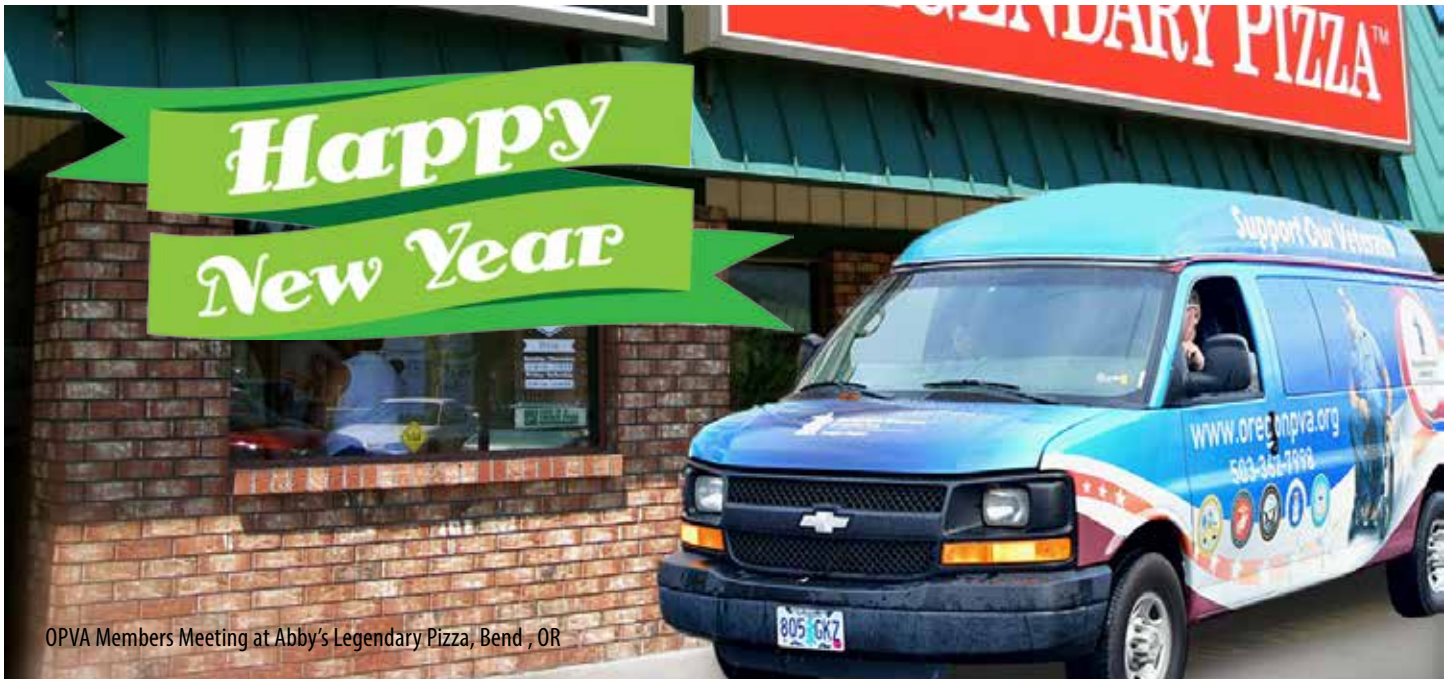
OPVA Members Meeting at Abby's Legendary Pizza, Bend , OR