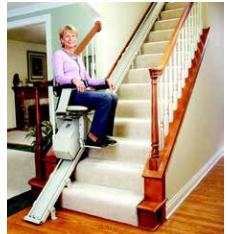
Summit Indoor Stair Lift SL350

OPVA has many items that have been donated to us for the purpose of giving to someone who needs it. Check with us before you purchase. All these items are given out FREE of charge.