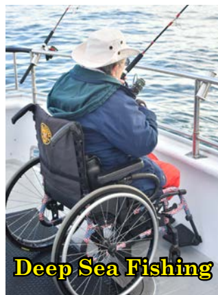
Deep Sea Fishing