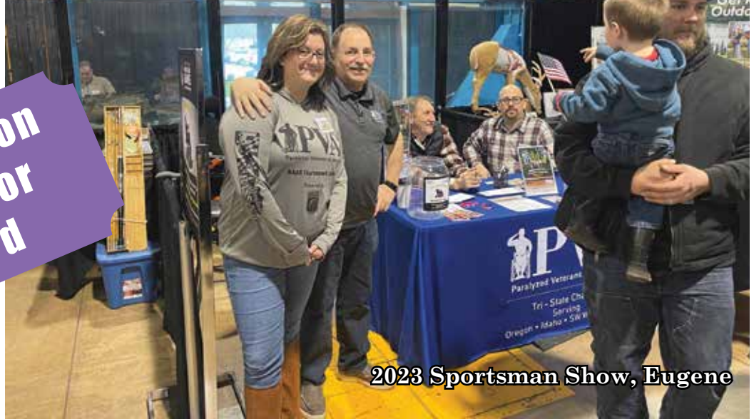
2023 Sportsman Show, Eugene