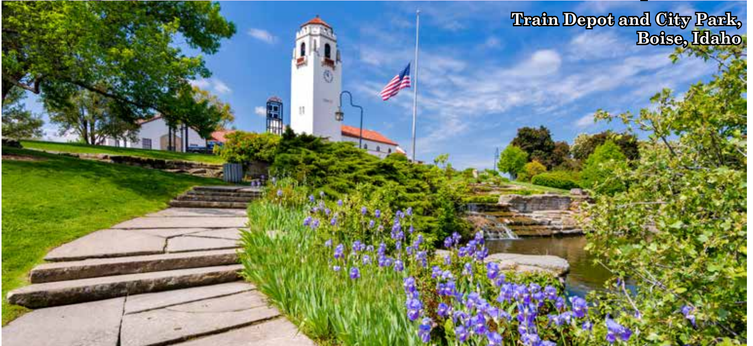
Train Depot and City Park, Boise, Idaho