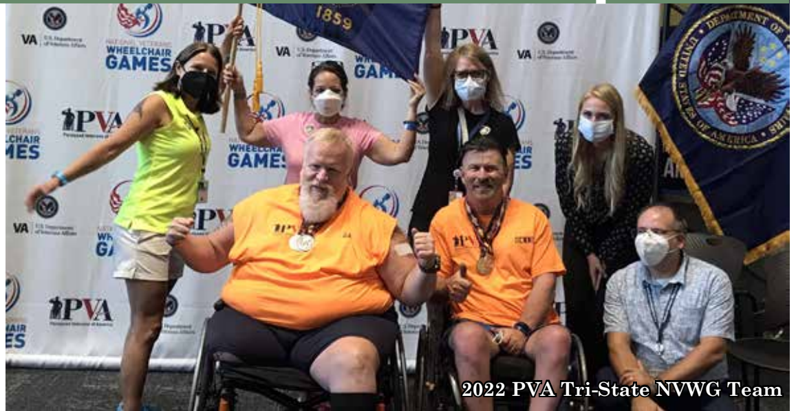
2022 PVA Tri-State NVWG Team