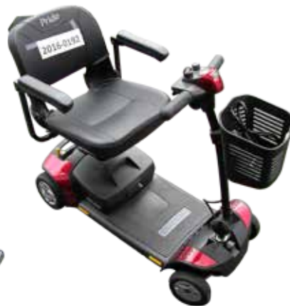
Go-Go Elite Traveller Plus 4-Wheel