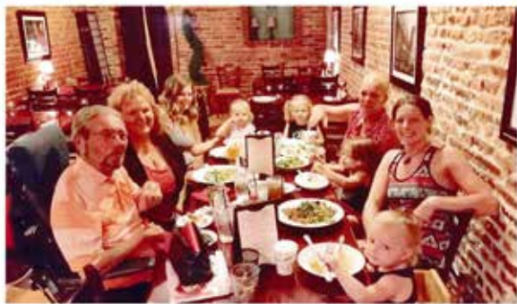
Meeting great granddaughters. Spending time with daughter grand