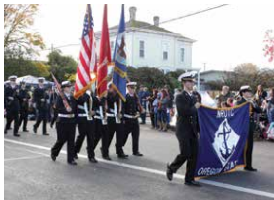
2015 Veterans Day Parade

The biggest and best Veteran's Day Parade in Albany will be on November 11th. We will have a float and need riders.