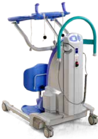
Standing and Raising Aid ArjoHuntleigh Sara Plus

If you or someone you know needs one of these items, contact us at: 503.362.7998