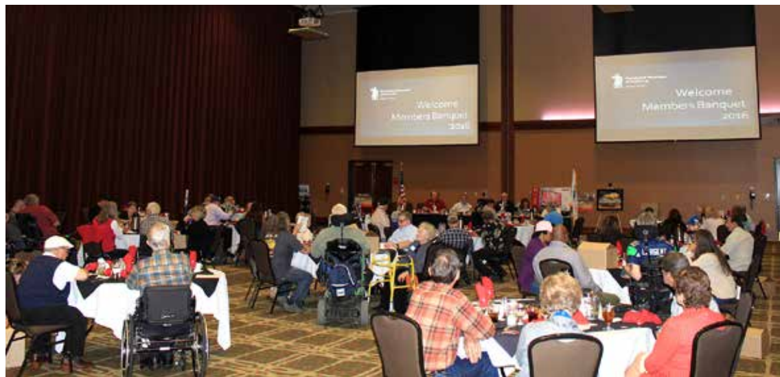
2016 Members Banquet at Spirit Mountain Casino

I hope we have a great new year. We aren't getting older, just better. Hope to see you soon.