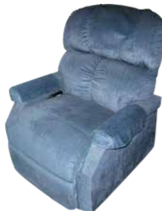
Lift Chair Recliner