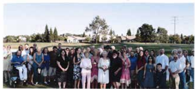
50th wedding Anniversary + family reunion

We are so grateful you offer the recreation fund. We were able to attend my brother and sister-in-laws 50th wedding anniversary and family reunion in California.