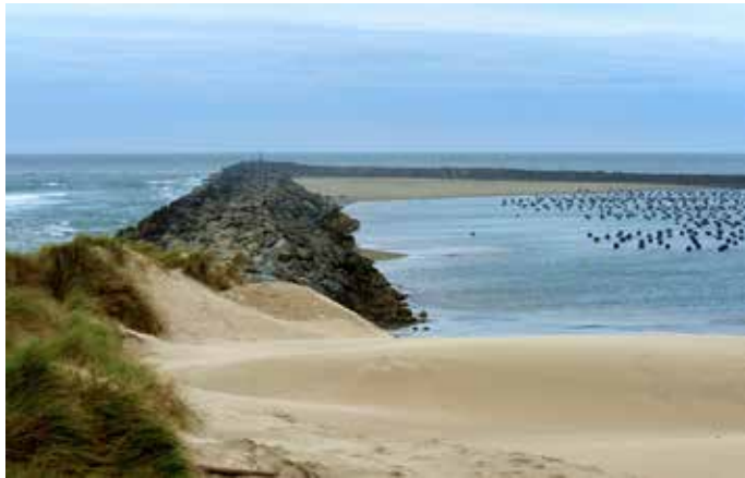
The view of the ocean and the dunes was fantastic! Hundreds of RVs, trailers, campers,

away we went. At first, I asked him not to go too fast. After awhile, he could see I was enjoying myself and threw caution to the wind. At one point I asked him if there were any "rules of the road" out on the dunes? Since, there were hundreds of rigs driving around out there...adults and kids! He said "Not really. Everyone just looks out for his or herself." We went flying up one dune after another doing turns and other maneuvers.