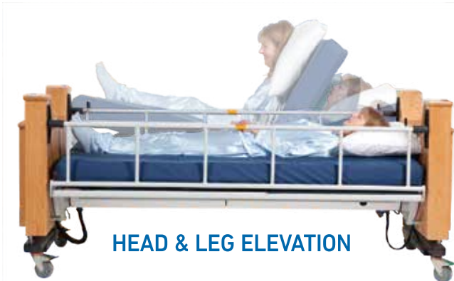
HEAD & LEG ELEVATION