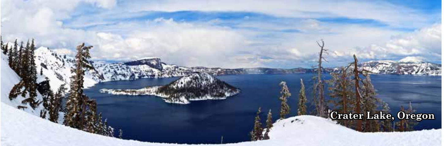
Crater Lake, Oregon