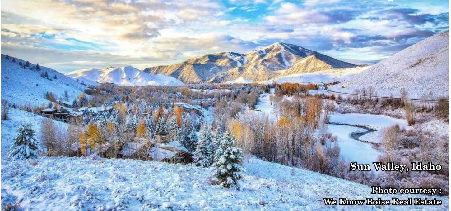
Sun Valley, Idaho