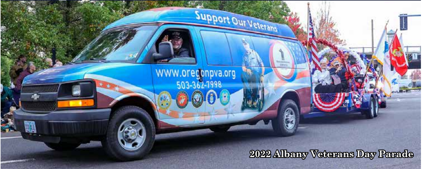
2022 Albany Veterans Day Parade