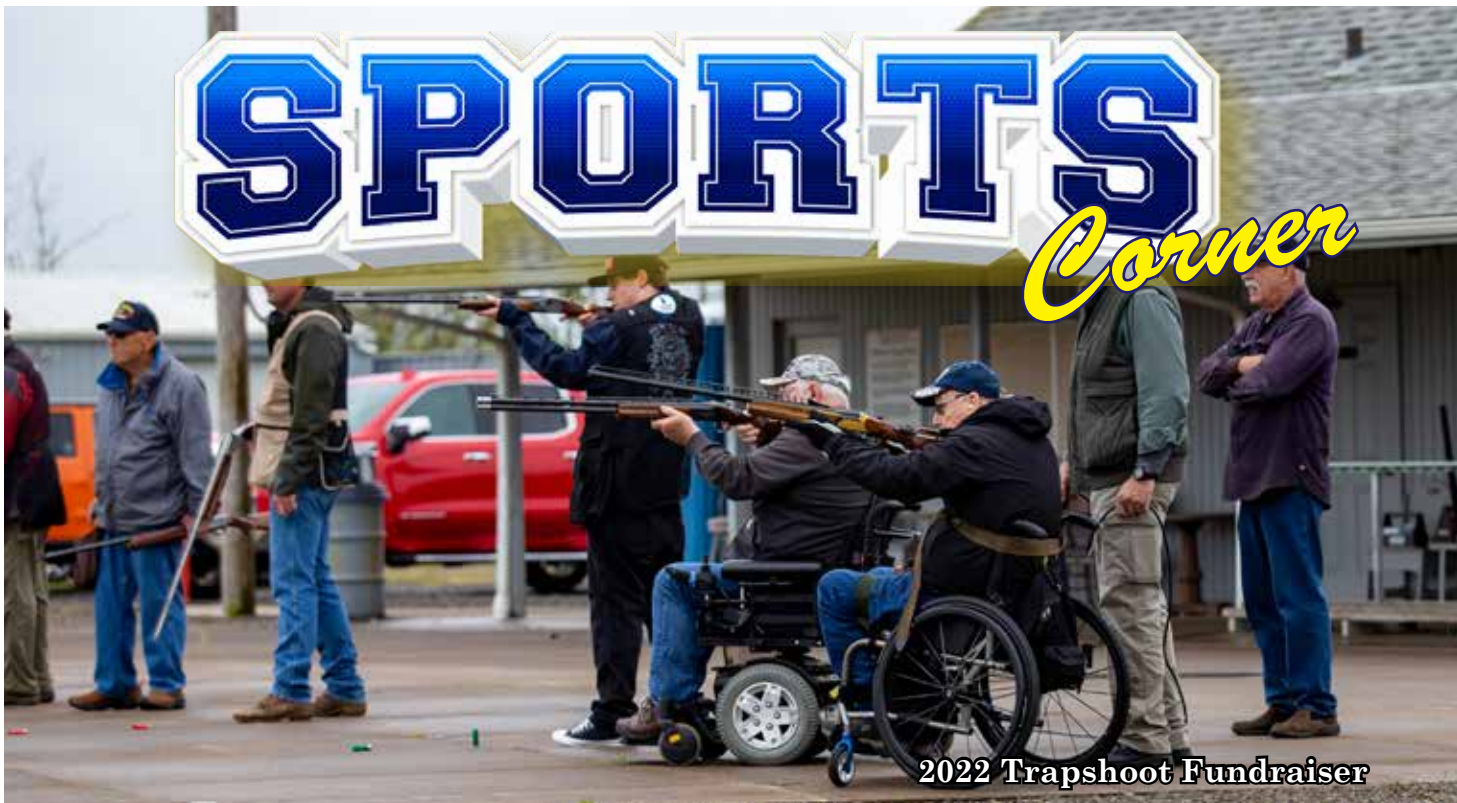
2022 Trapshoot Fundraiser